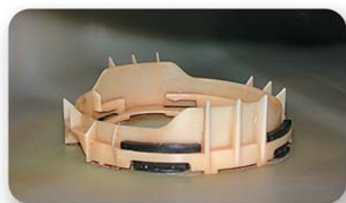
IN-TANK FUEL PUMP LOCK RING