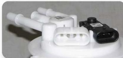
GM FUEL PUMP MODULE WITH NEW HARNESS CONNECTOR

New wiring harness included. Refer to enclosed installation instructions.