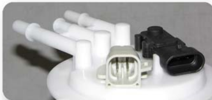
GM FUEL PUMP MODULE WITH OLD HARNESS CONNECTOR