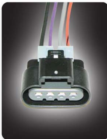
NEW VEHICLE HARNESS INCLUDED WITH FUEL PUMP MODULES