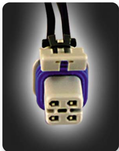
OLD VEHICLE HARNESS SOLD SEPARATELY

Fuel pump modules with the improved 4-pin connector require vehicle harness replacement. One of the five application-specific, color-coded vehicle wiring harnesses is included with every pump that uses the new connector.